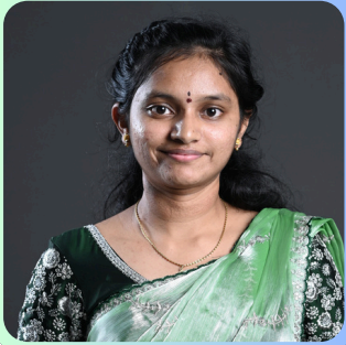
Gompa Sahasra 7 th Jun