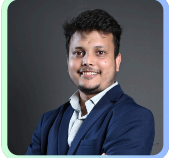
Manoranjan 6 th Jun